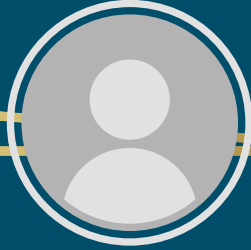
Vacant Lead for Healthwatch Medway