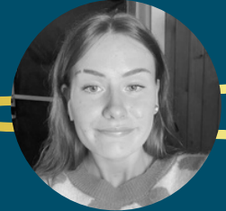
Tass Projects and Engagement Officer, Medway